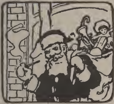
A Jolly Old Man Appeared

“ONCE upon a time,” began daddy, “a little mouse had heard when he was hiding in holes in the corners of the rooms that all the little boys and girls in the world once a year had a Christmas tree full of goodies. A dear old person named Santa Claus trimmed the tree for them and filled the stockings which they hung up by the fireplaces.